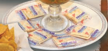
Coctel de Camaron