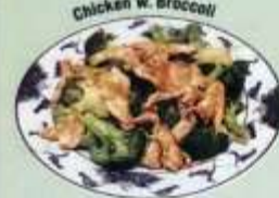
Chicken w. Broccoli