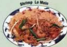
Shrimp Lo Mein