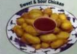
Sweet & Sour Chicken