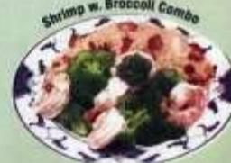
Shrimp w. Broccoli Combo