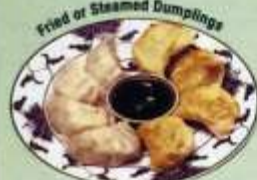
Fried or Steamed Dumplings