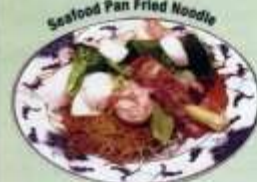
Seafood Pan Fried Noodle