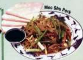
Moo Shu Pork