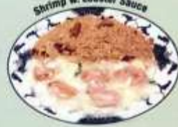
Shrimp w. Lobster Sauce