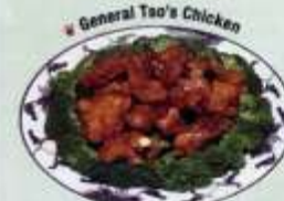
General Tao's Chicken