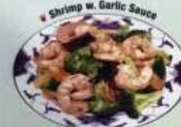
Shrimp w. Garlic Sauce