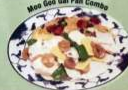
Moo Goo Gai Pan Combo