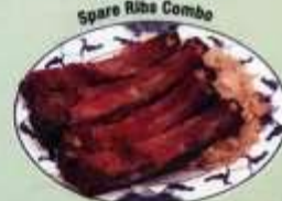
Spare Ribs Combo